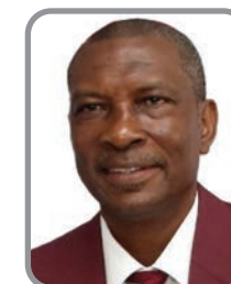
Roger Harper Cricket Legend