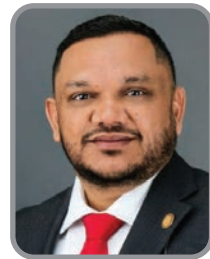
Hon. Vickram Bharrat Minister of Natural Resources

as a Member of Parliament. He has held key ministerial roles, including Minister of Housing and Water and Minister of Tourism, Industry and Commerce, and is known for having spearheaded major housing development initiatives in Guyana. Dr. Ali is married and a father of two.