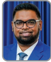
His Excellency, Dr. Mohamed Irfaan Ali President of Guyana

Dr. Mohamed Irfaan Ali is Guyana's Ninth Executive President (since August 2, 2020). He was born on April 25, 1980, in Leonora, and was educated at Leonora schools, Cornelia Ida Primary, and St. Stanislaus College. He holds multiple academic qualifications, including a Doctorate in Urban and Regional Planning from the University of the West Indies, as well as degrees in business, law, finance, and planning from international institutions. Before becoming President, he served as a Project Manager and Senior Planner and later entered politics in 2006